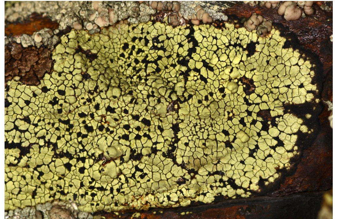
Photograph of lichen taken in the field in Great Smoky Mountains National Park

Delivering Your Images to the Digital Asset Manager