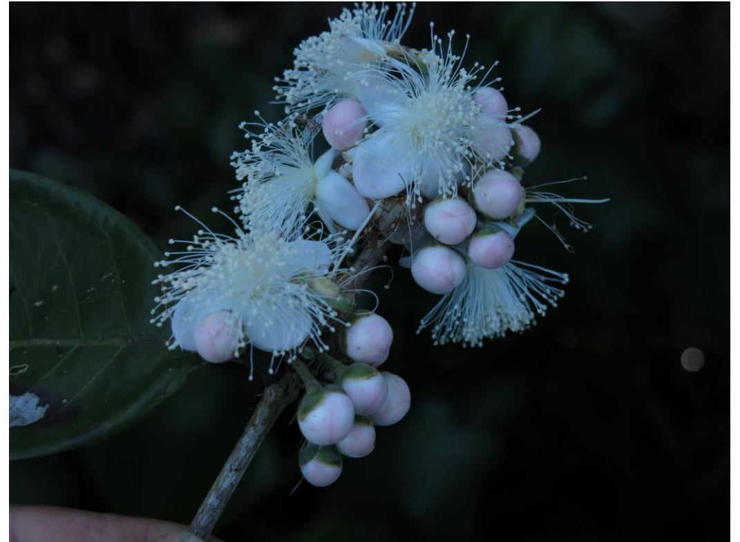
Field photograph of K. S. Gonçalves 439.